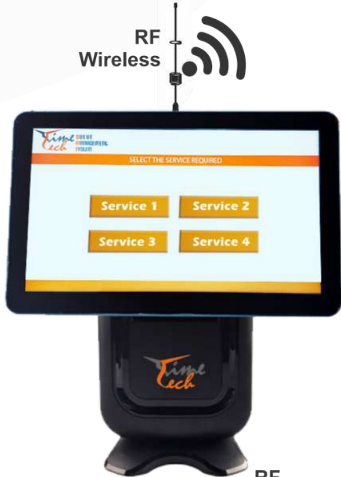
Touch Screen Ticket Generator KIOSK Machine (Sys. Server)