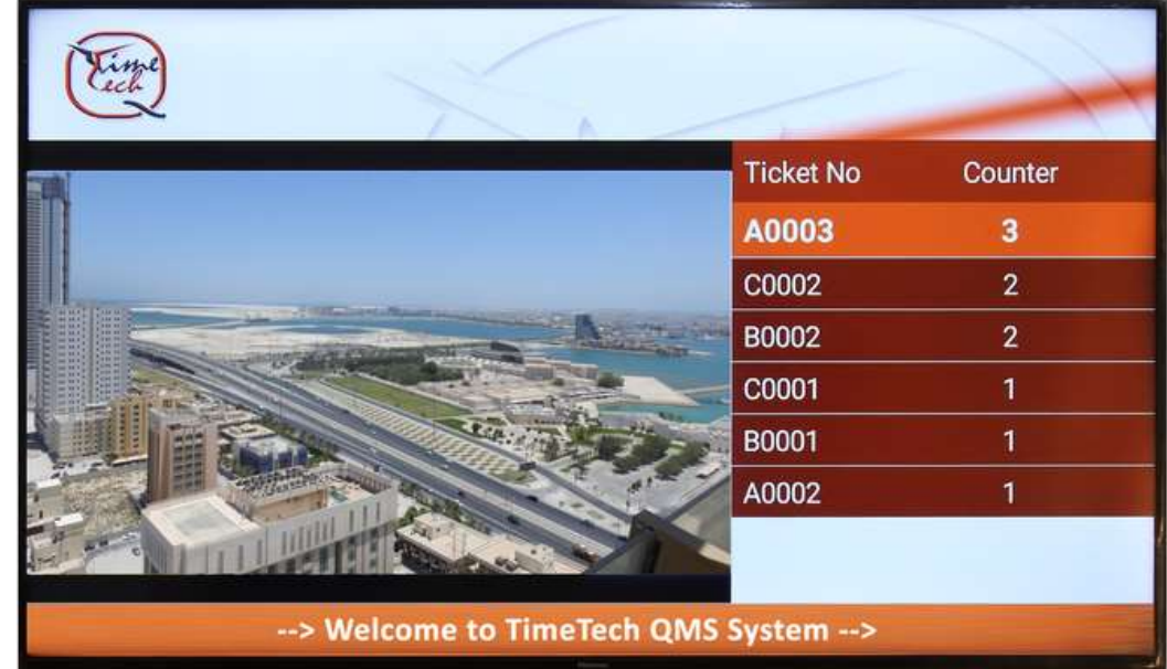
Waiting Area Display & Audio Announcement