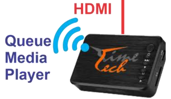
Queue Media Player