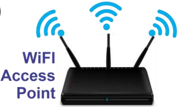
WiFi Access Point